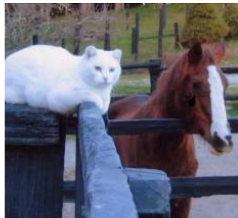
Snowy and his equine friend