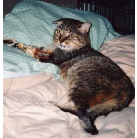
Wally - after