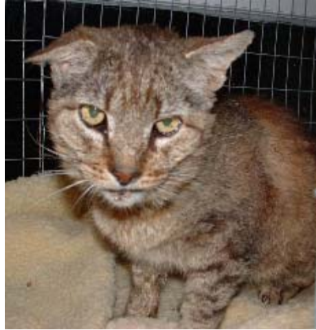
Wally - before