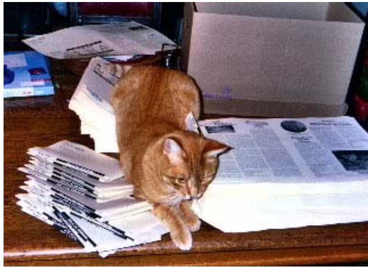
Goldie supervises the folding of Project Purr's newsletter

Too many people are under the impression spaying/neutering can only be done after a cat reaches the age of 5-7 months. Early age altering of cats has been practiced for over 25 years in North America. By tradition (due to poor anesthesia techniques) waiting until a cat was older increased the survival rate during surgery. However, with modern technology and better anesthesia techniques, there is no need to prolong spaying and neutering as a medical reason.